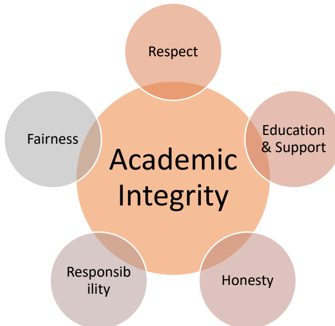
Figure 1: Academic Integrity

Academic integrity is fundamental to the academic endeavour and business of the Institute. Dishonest practices contravene academic values, compromise and devalue the quality of learning. Through its activities, the Institute is committed to principles of ethical behaviour and integrity among its staff and students. This Framework intends to reinforce the importance of integrity in an academic environment through its Policies, Procedures and other related documents (see related documents Item 4 ).