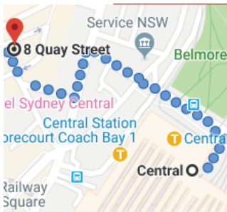
Level 6, 8 Quay Street, Haymarket NSW 2000

Tel: 61 2 9211 4958 Website: http://www.ee.edu.au Email: admission@ee.edu.au / info@ee.edu.au